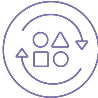
Consult App Deployment